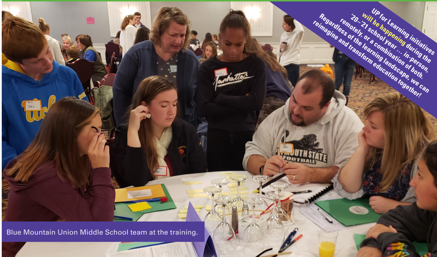
Blue Mountain Union Middle School team at the training.

GTY will be offered as a customized training. During COVID-19, GTY training will be customized for each school! Contact Sharon ( sharon@upforlearning.org ) with questions, or to arrange an option that fits your school's needs.