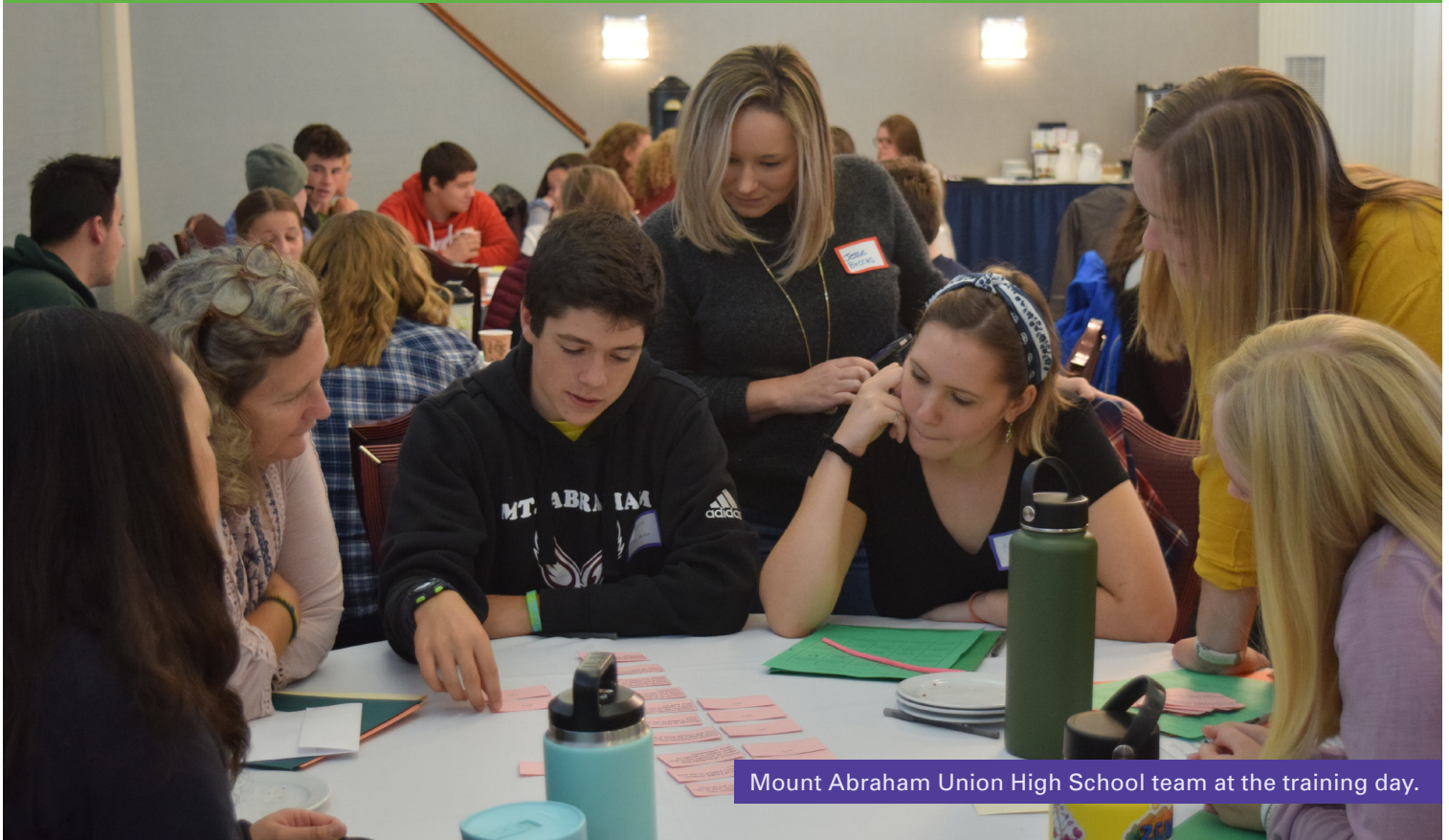
Mount Abraham Union High School team at the training day.

October 13, 2020 • Capitol Plaza, Montpelier