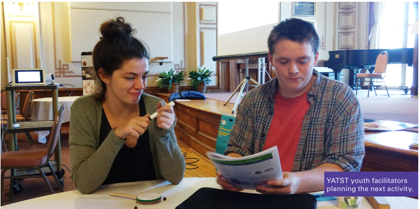
YATST youth facilitators planning the next activity.