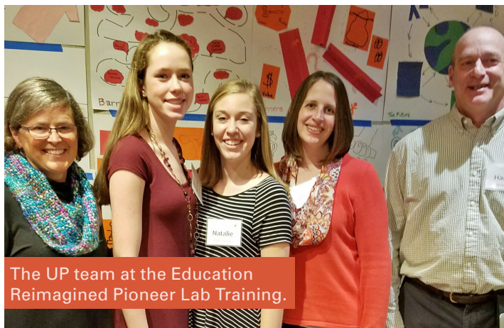
The UP team at the Education Reimagined Pioneer Lab Training.

The next steps will be to carry out the survey. YATST Team members will visit every classroom in the Career Center to present background information on student voice and the survey tool, and facilitate the logistics of the survey. From there, the team will analyze the data, plan and facilitate dialogue activities with the whole school community and work toward agreement on best steps to take moving forward.