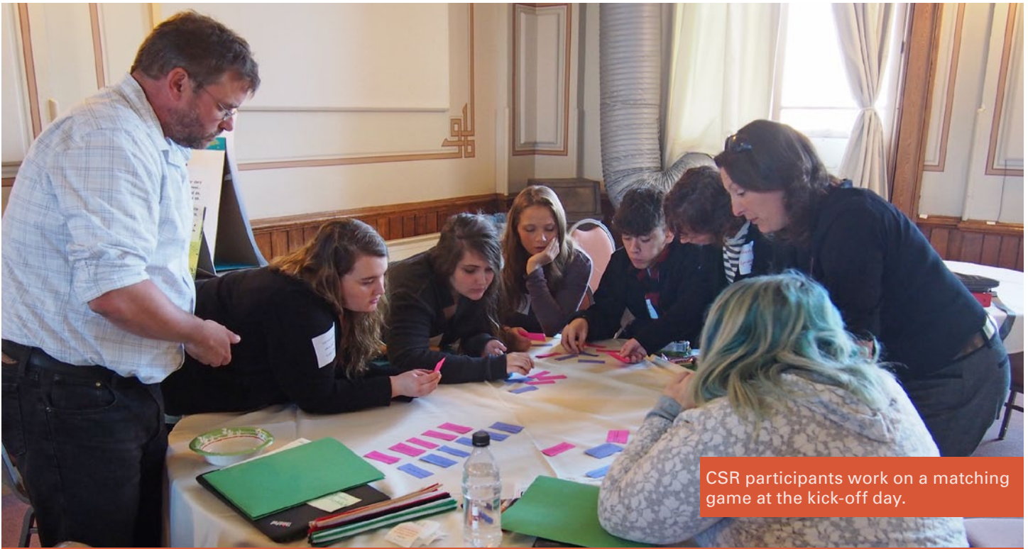
CSR participants work on a matching game at the kick-off day.