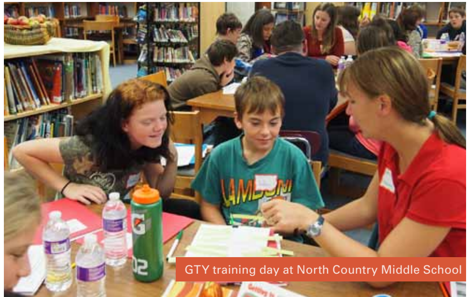
GTY training day at North Country Middle School

Create Open Dialogue. Deep conversation is central to changing school cultures. Young people are particularly able initiators of this dialogue, creating a shared vision for education and the learning process.