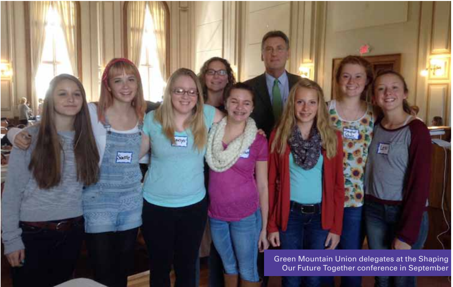
Green Mountain Union delegates at the Shaping Our Future Together conference in September