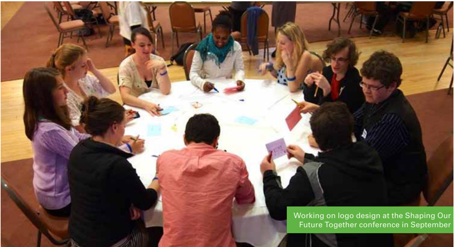
Working on logo design at the Shaping Our Future Together conference in September